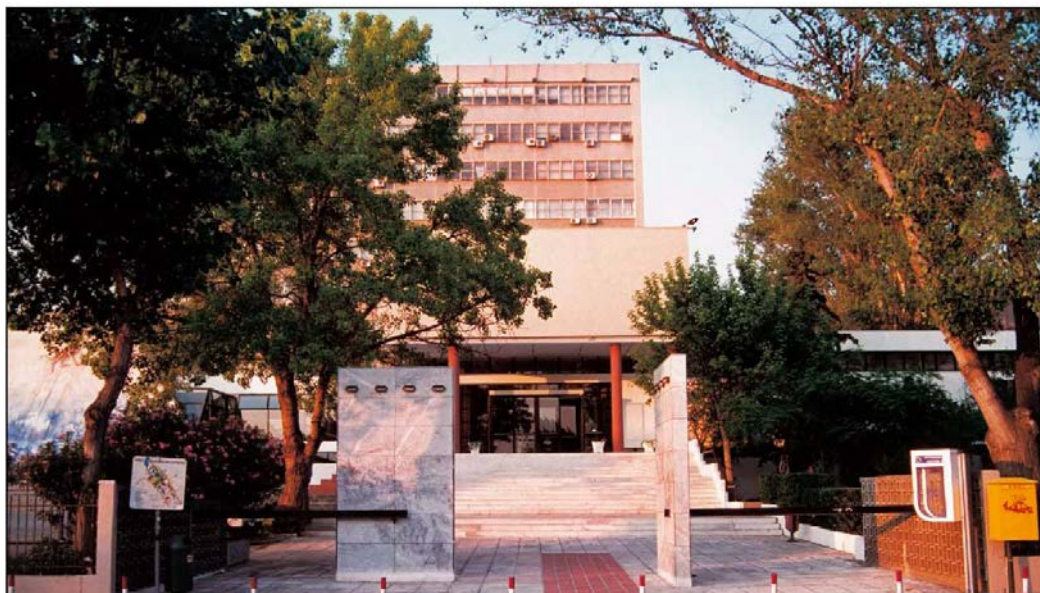
Façade of the Faculty of Engineering