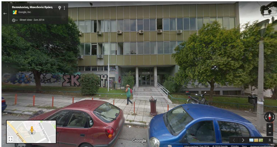
Façade of the Laboratory of Hydraulics