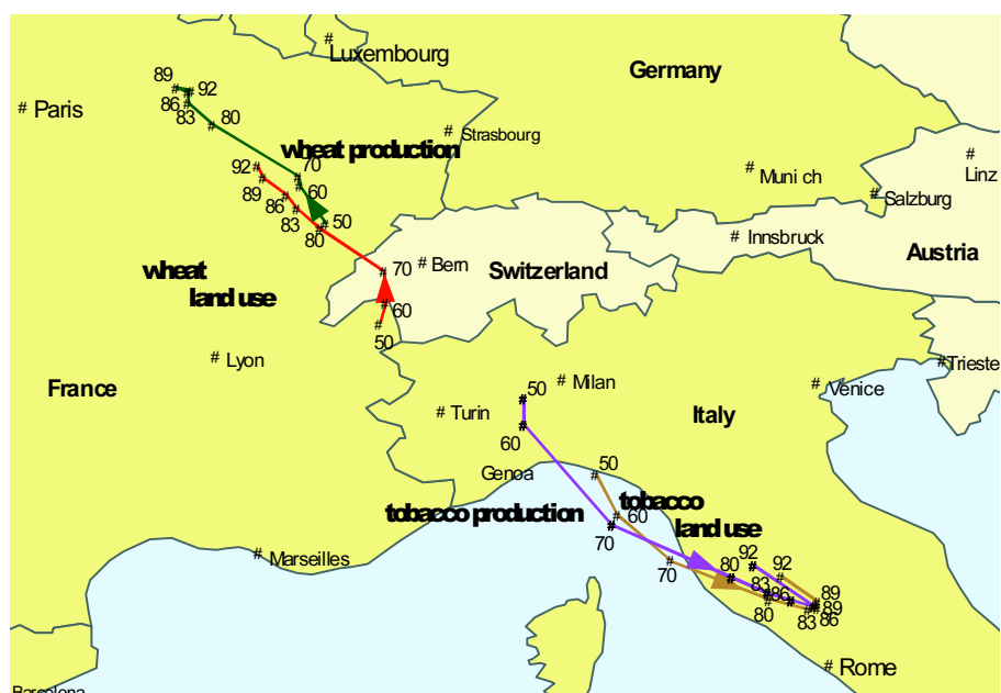
Figure 2. Movements of the centre of gravity for wheat and tobacco, production and land use

To investigate whether, and in which direction, wheat and tobacco production have moved across the European continent, we have calculated the centre of gravity of production and land use for both crops (Figure 2).